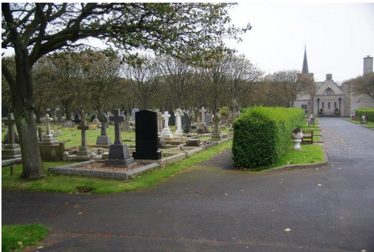
Whitley Bay Cemetery