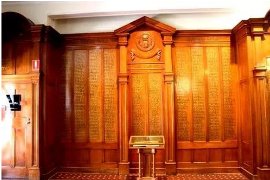
Glenelg Soldiers' Memorial Honour Board