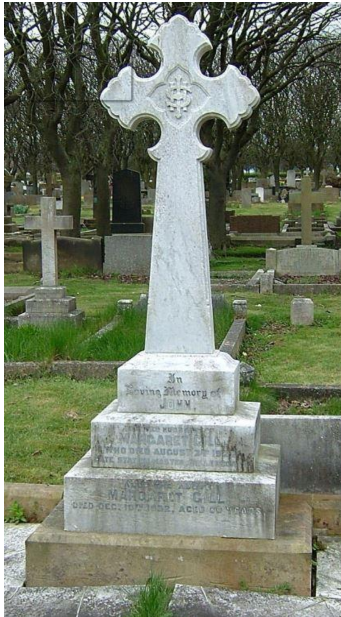
Photo of Sergeant Roy Neville White's shared Private Headstone with Gill Family members in Whitley Bay Cemetery, North Tyneside, Tyne and Wear, England.