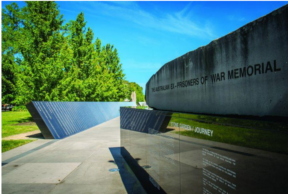
The Australian Ex-Prisoners of War Memorial, Ballarat