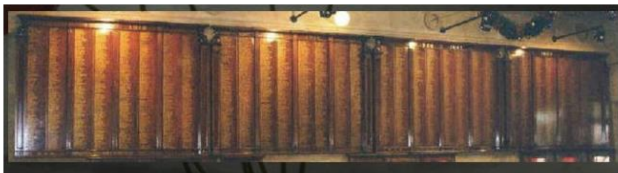
South Australian Railways Honour Board

R. N. White is remembered on the South Australian Railways Honour Board, located at Adelaide Railway Station concourse north end, North Terrace, Adelaide, South Australia.