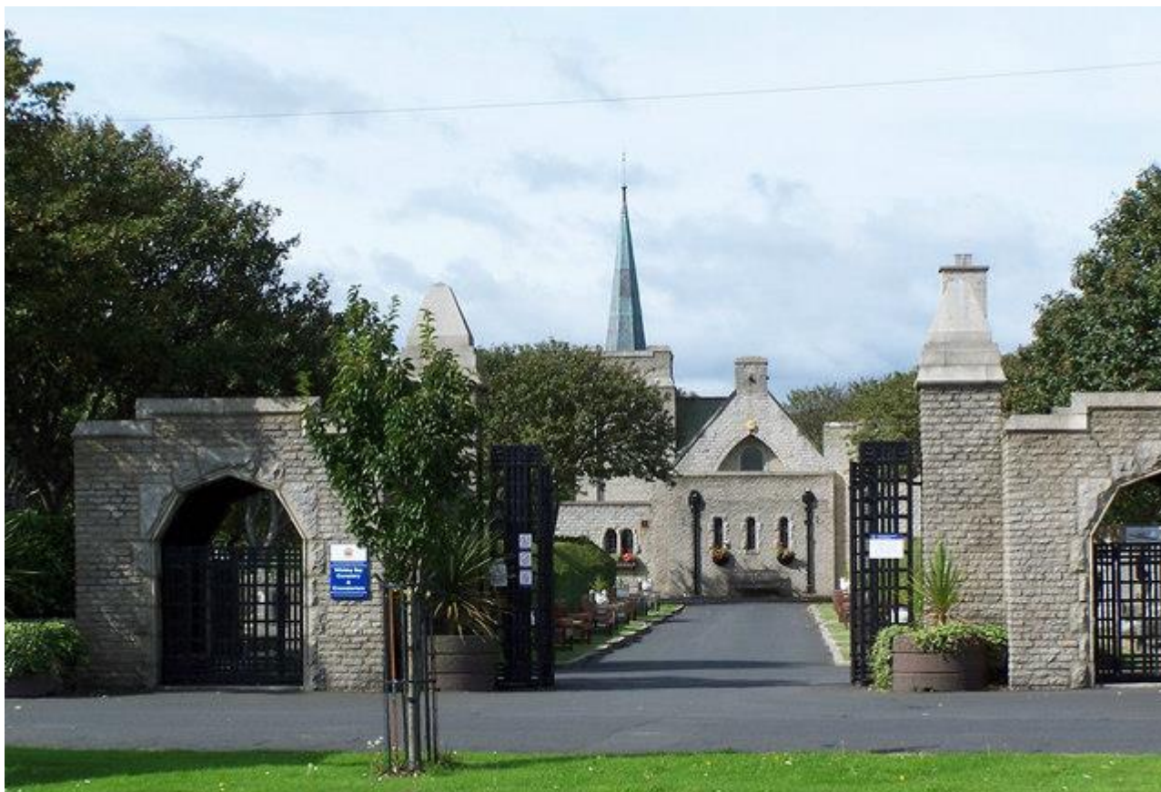
Entrance to Whitley Bay Cemetery

Whitley Bay Cemetery contains 67 Commonwealth War Graves – 22 from World War 1 & 49 from World War 2, 4 of which are unidentified seamen of the Merchant Navy.