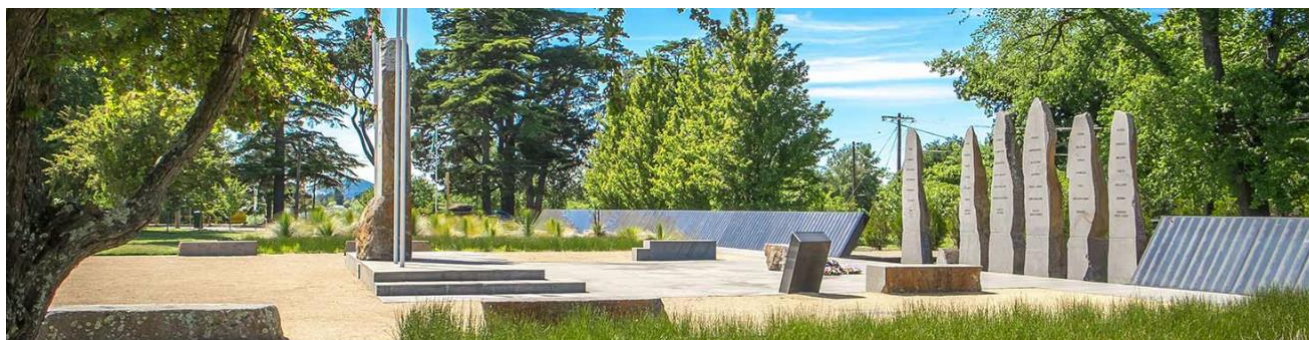
The Australian Ex-Prisoners of War Memorial, Ballarat